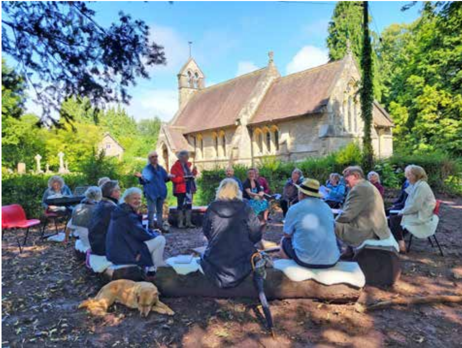
Harpley Circle service in late July in the woodland retreat area of the churchyard.