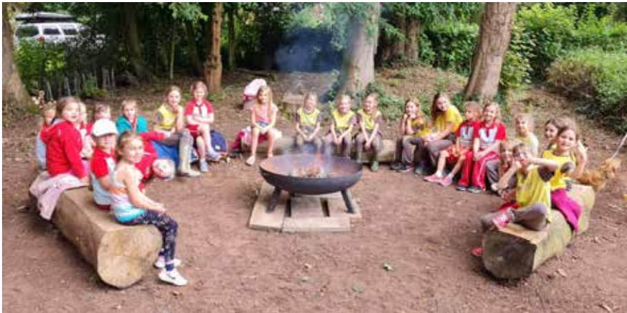
Clifton Brownies and Rainbows roasting marshmallows in the grounds of Harpley church