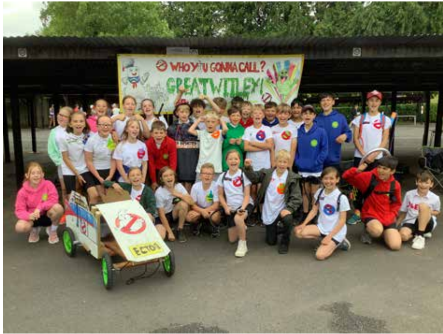
Great Witley CE Primary School's winning 'Ghostbusters' Rally team

Hundreds of pupils from 15 Rivers CofE Academy Trust schools across the region put their Design Technology skills to the test at a special Box Car Rally at the Shelsley Walsh Hill Climb in July.