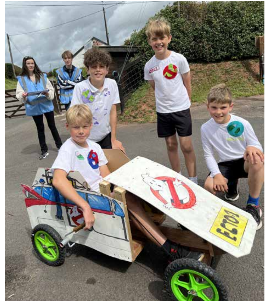
Some of Great Witley Primary's winning team