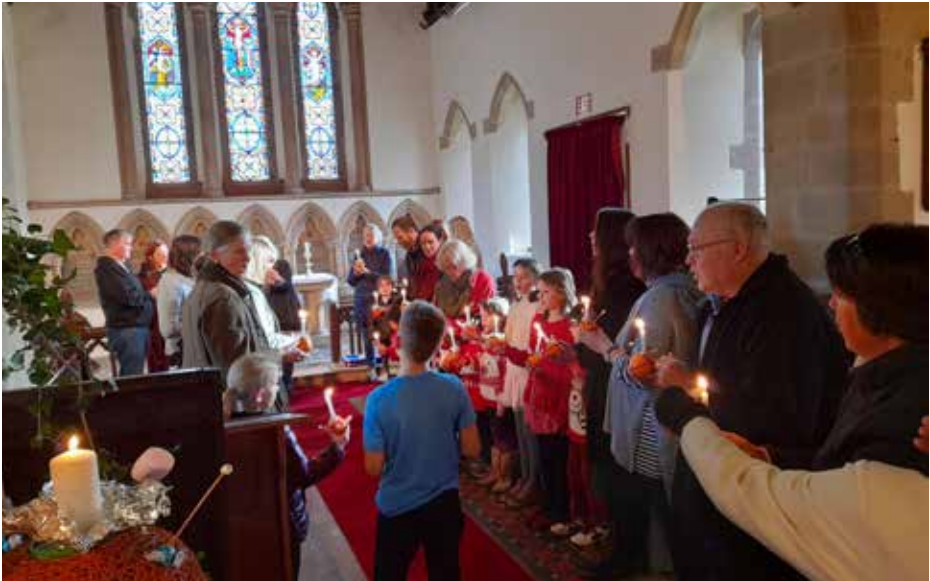
The Christingle service held at St Bartholomew's Church Harpley