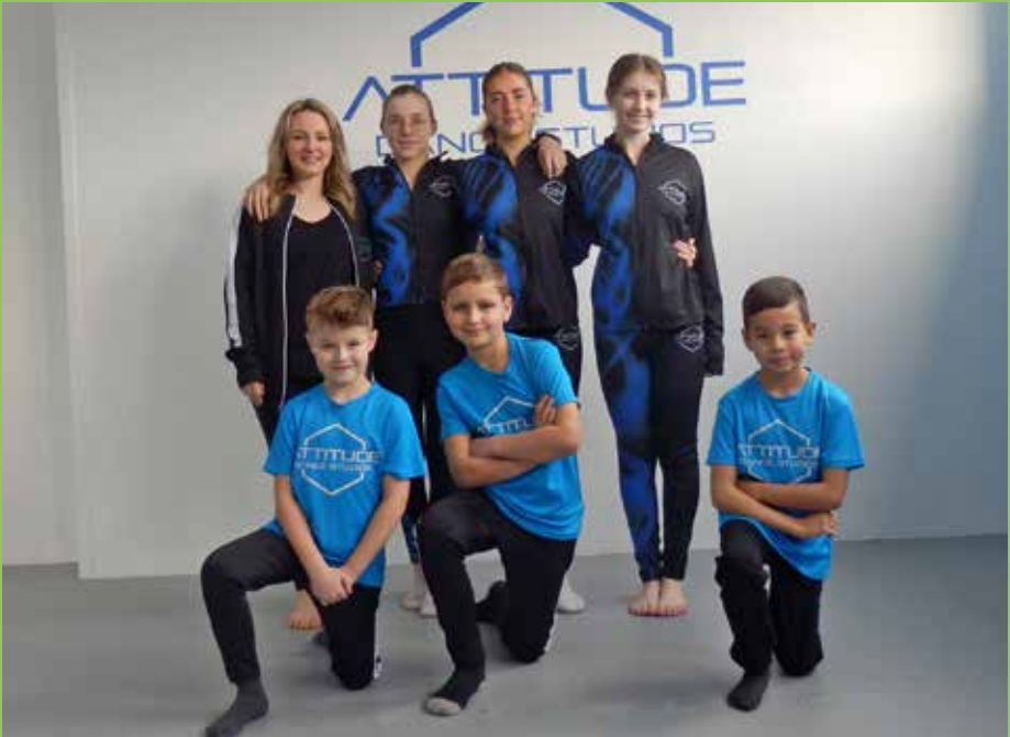
Local Dance Studio Students

Clifton upon Teme • The Shelsleys • Lower Sapey