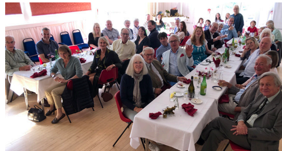
Shelsley parishioners enjoying the Harvest lunch in the Village Hall