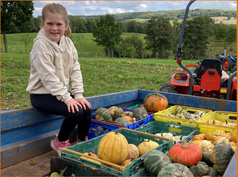
Harvesting for the Charity Pumpkin Pile at Pitlands Farm in Clifton

Clifton-upon-Teme • The Shelsleys • Lower Sapey