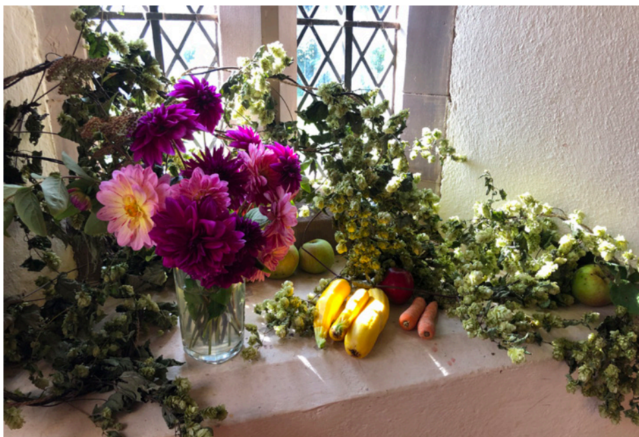
Food and flowers on display at the All Saints Harvest Service on 8 October.