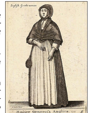
A 17 th century English gentlewoman