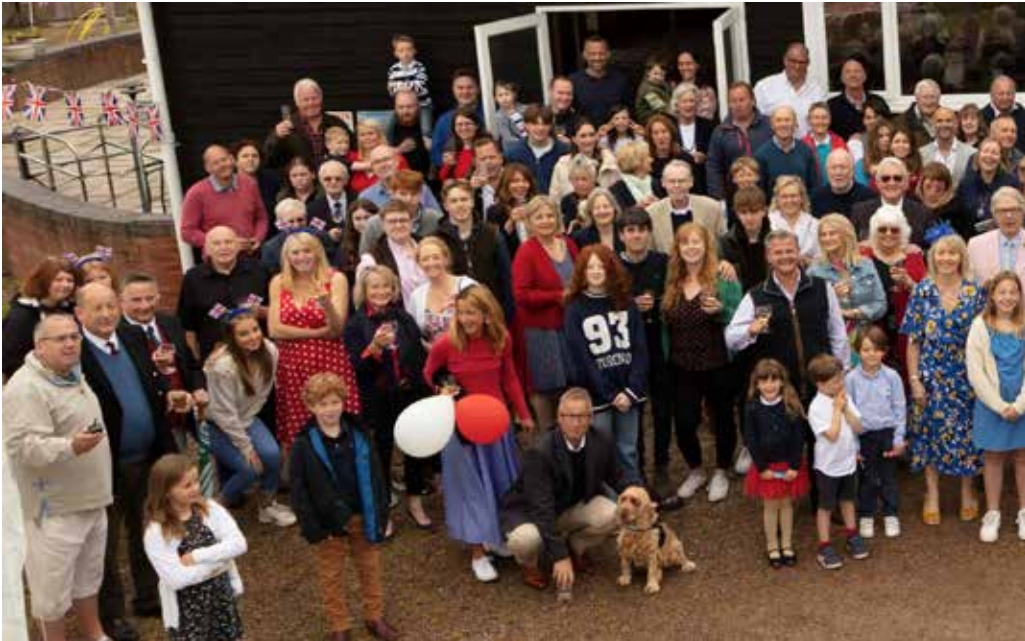
Nearly 200 residents from across the Shelsleys gathered for a commemorative