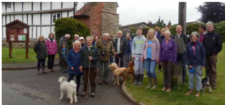
Clifton villagers gathering outside the village hall at the start of the Jubilee walk