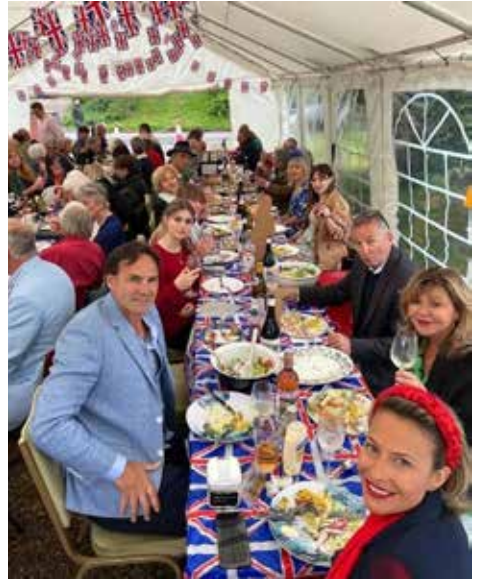
Shelsley folk enjoy a patriotic Jubilee picnic (above).