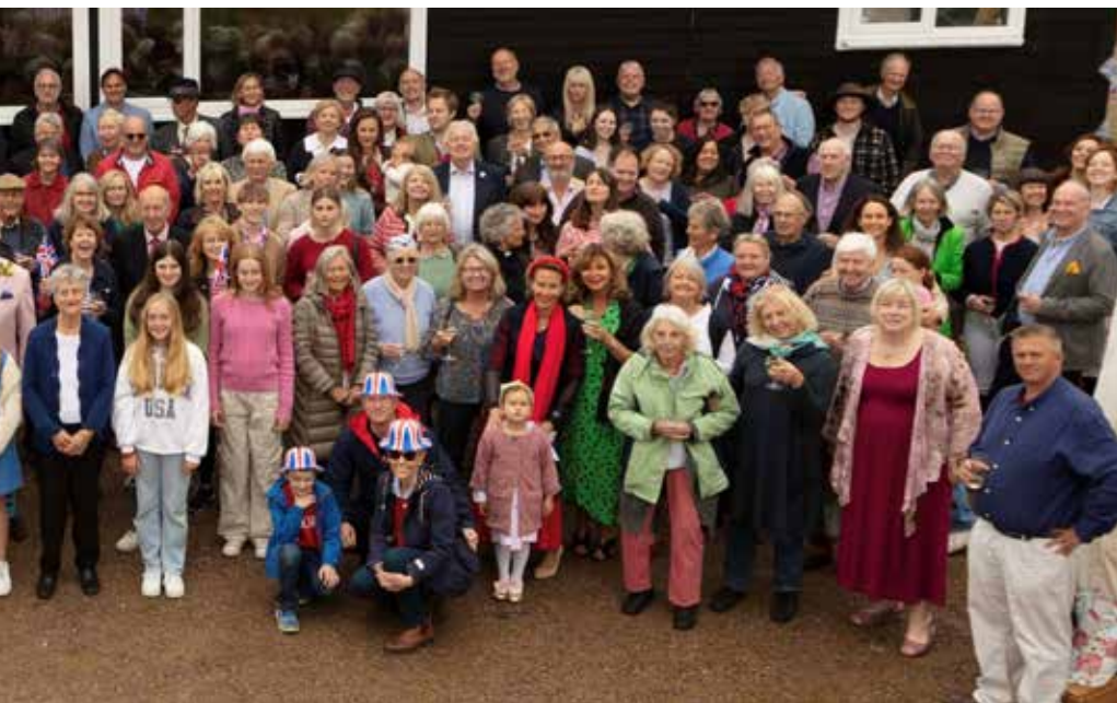
Platinum Jubilee photo outside the Village Hall