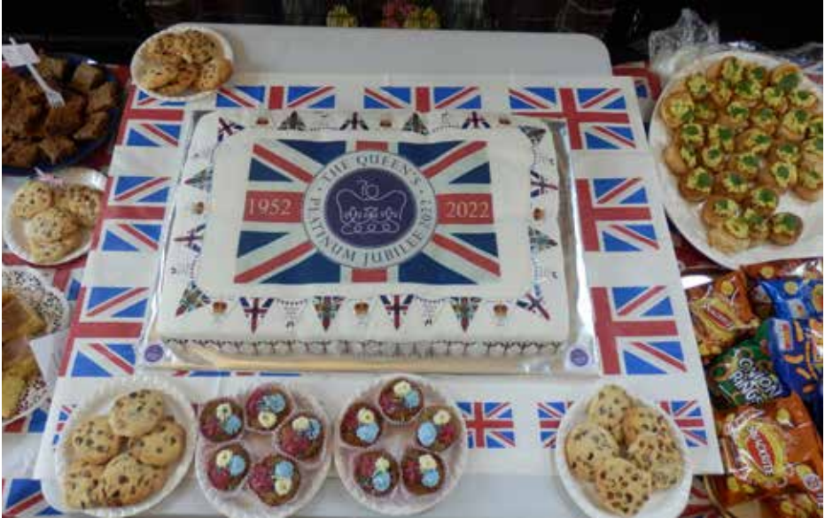
The Platinum Jubilee cake created by Clifton WI