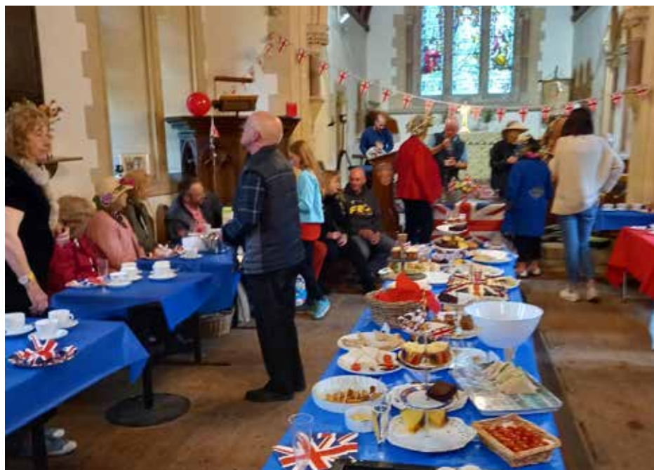
Jubilee celebrations in Harpley Church