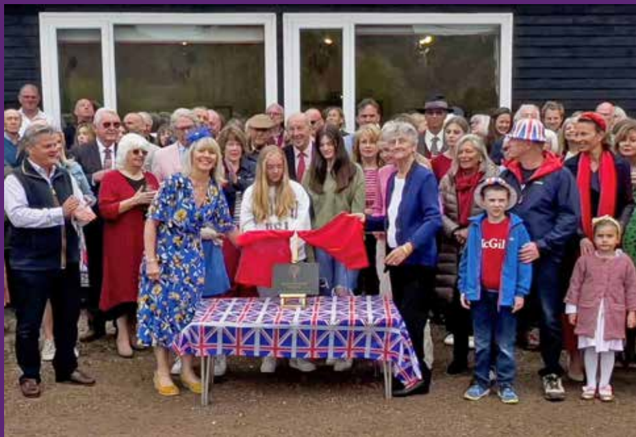
Shelsley's Green Canopy Plaque

Clifton upon Teme • The Shelsleys • Lower Sapey