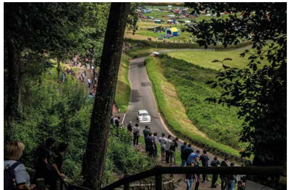
Above: The Shelsley Walsh Hill Climb's 2022 event season is expected to attract thousands of race enthusiasts and spectators to the Valley. (See season preview on page 12.)