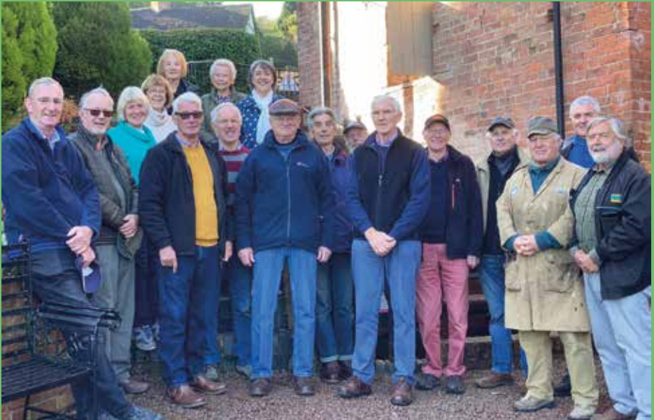
Volunteer members of the Shelsley Walsh Water Mill Society

Clifton upon Teme • The Shelsleys • Lower Sapey