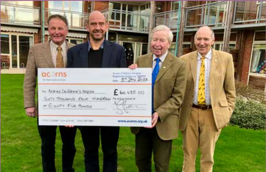
Locals raising money for Acorns Children's Hospice

Clifton upon Teme • The Shelsleys • Lower Sapey