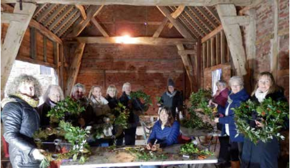
Members of the 'Sustainable Church Flowers' group at their advent wreath workshop.