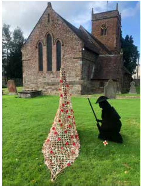
Beautiful All Saint's – We will remember them.