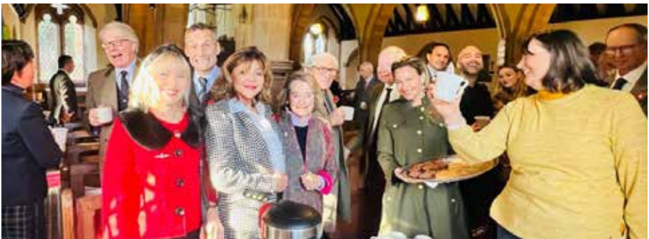
Shelsley Parishioners enjoying refreshments together after the service.