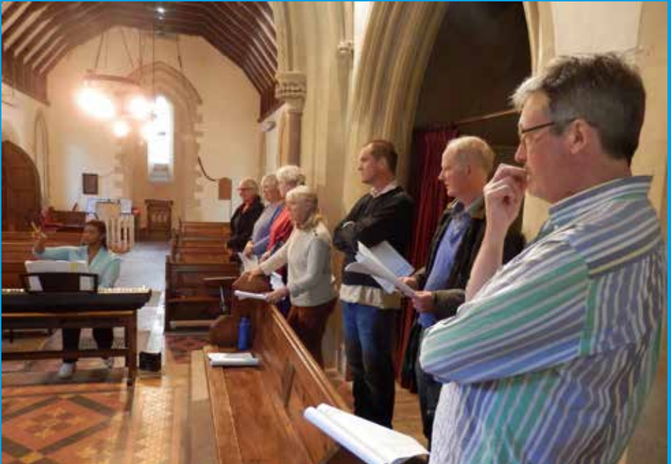
Harpley Choral Masterclass

Clifton upon Teme • The Shelsleys • Lower Sapey