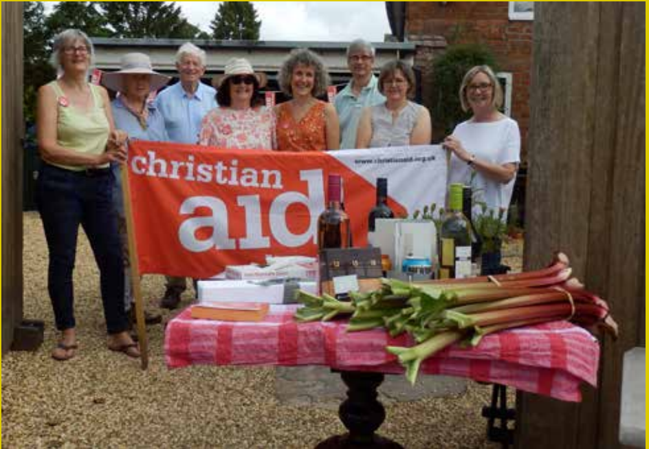
Fundraising for Christian Aid in Clifton

Clifton upon Teme • The Shelsleys • Lower Sapey