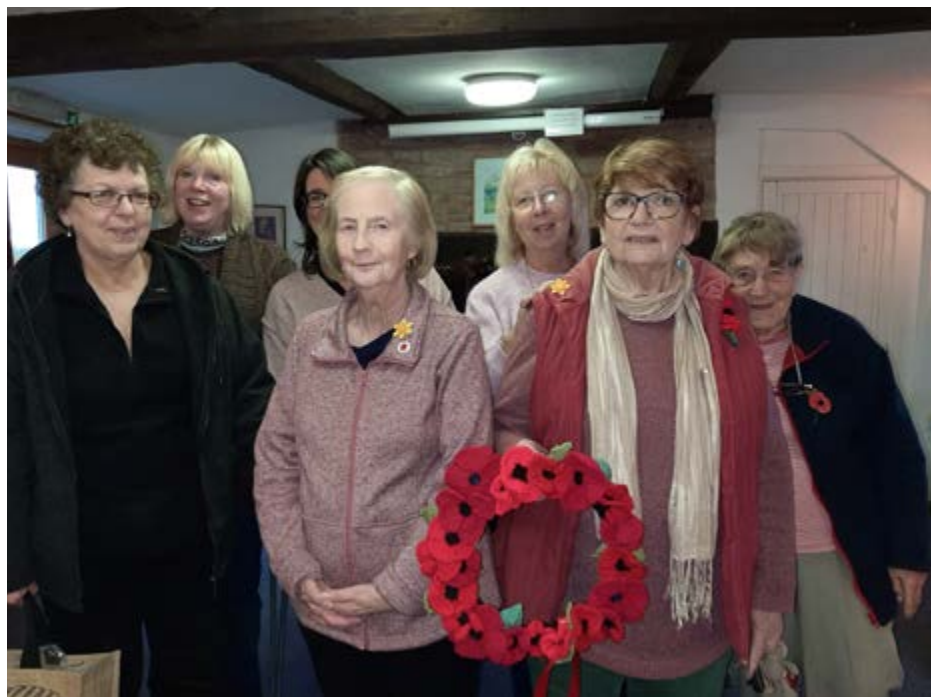
Members of the Clifton Crafters with their knitted poppy wreath