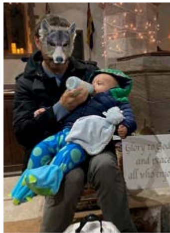
Halloween Light Party held in St Kenelm's Church