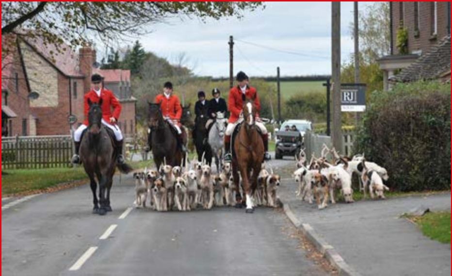
Clifton on Teme Hunt

Clifton upon Teme • The Shelsleys • Lower Sapey