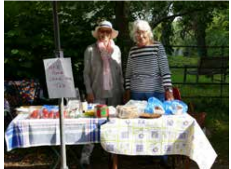
The 'Big Breakfast Bap' fundraising morning at Harpley Church.