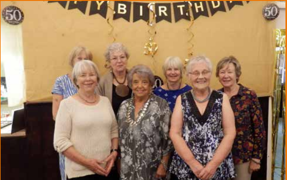
The Clifton Friendship Club Team celebrating 50 years

Clifton upon Teme • The Shelsleys • Lower Sapey