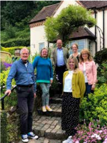
The TT Team