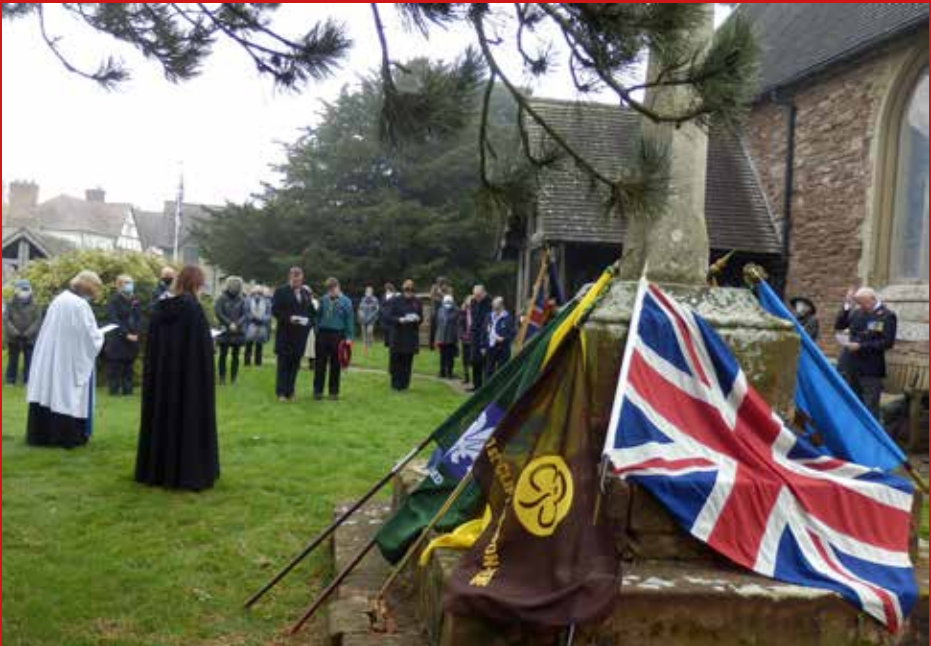
Clifton remembers those who fell in battle

Clifton upon Teme • The Shelsleys • Lower Sapey