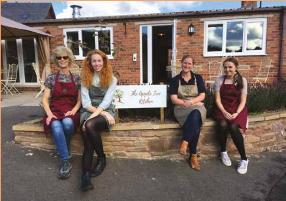
Pitlands Farm opens The Apple Tree Kitchen

Clifton upon Teme • The Shelsleys • Lower Sapey