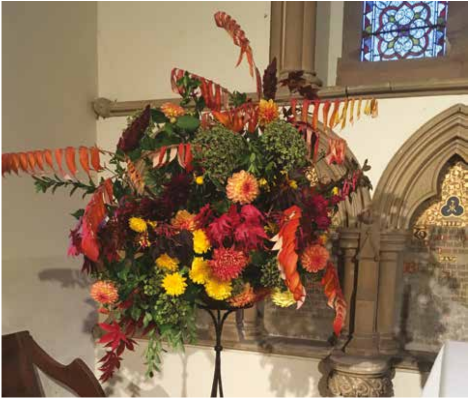
One of the magnificent flower displays created for the Harvest Service at All Saints Church, Shelsley Beauchamp on Sunday 18 October (Full story on page 13).