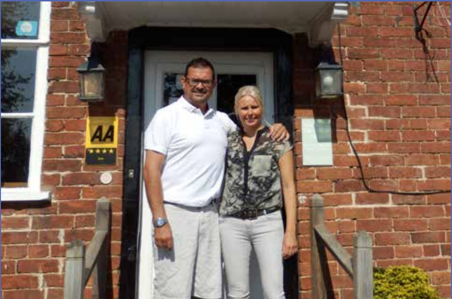
New tenants at The Lion

Clifton upon Teme • The Shelsleys • Lower Sapey