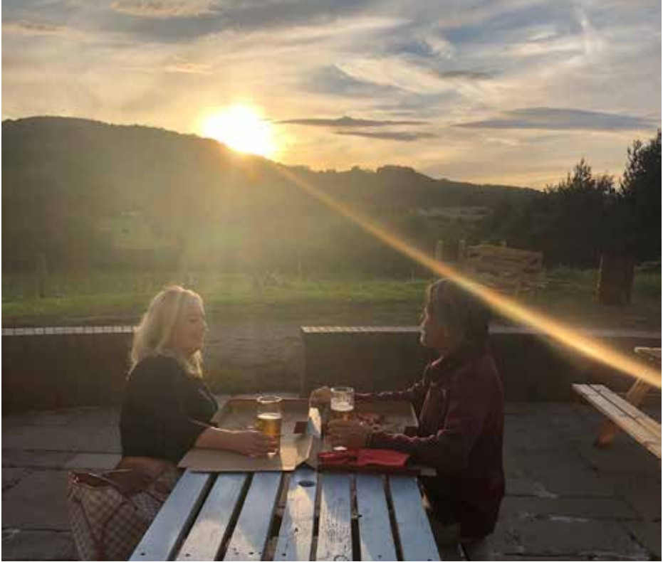
Local residents enjoying a takeaway pizza whilst watching the sunset at the Shelsley Social Club.