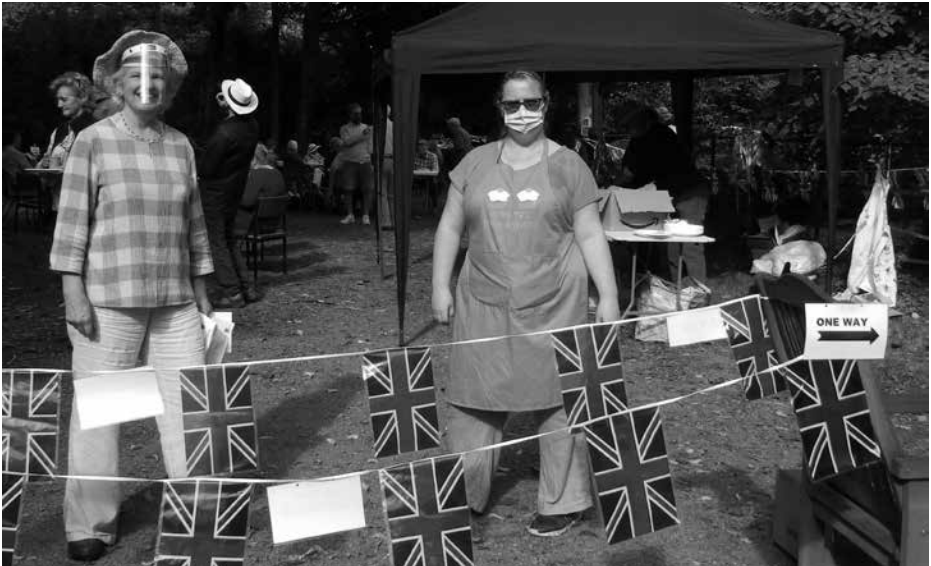
The Harpley Church 'Big Breakfast' fundraiser.