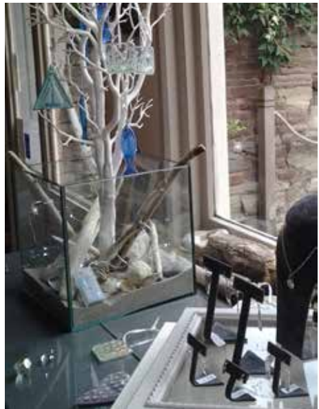
Examples of some of the fabulous products on sale at 'Marie Anne Silver Designs', Mill Farm Retail.