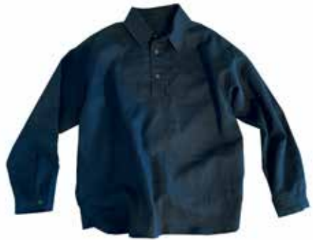
Shirts from the 'Ella Griffee Studio' fashion brand.