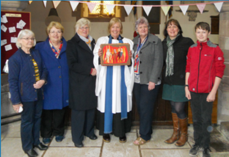
Locals gather to dedicate a memorial kneeler at St Kenelm's, Clifton

Clifton upon Teme • The Shelsleys • Lower Sapey