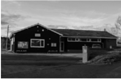
Shelsleys' Village Hall. The Social Club entrance is on the right

“We’d love even more locals to come along and make the most of our facilities. Drinks are well below city centre prices, there’s a TV to watch sports and news in the bar, and nothing beats the view from our patio on warmer evenings. We’re also dog-friendly for walkers and close to the Worcestershire Way. Everyone is welcome to try it out before they join.”