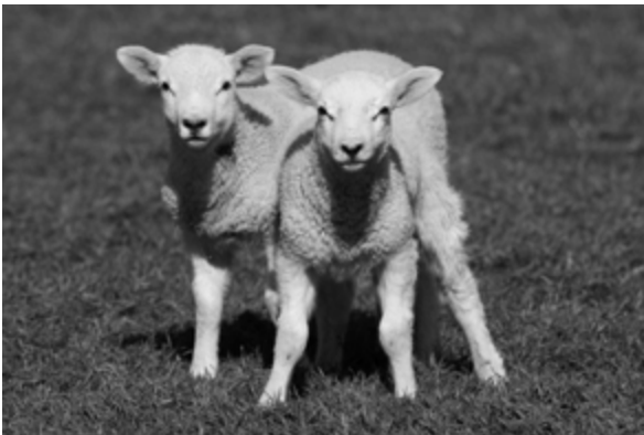
Twin spring lambs pictured near Shelsley Beauchamp