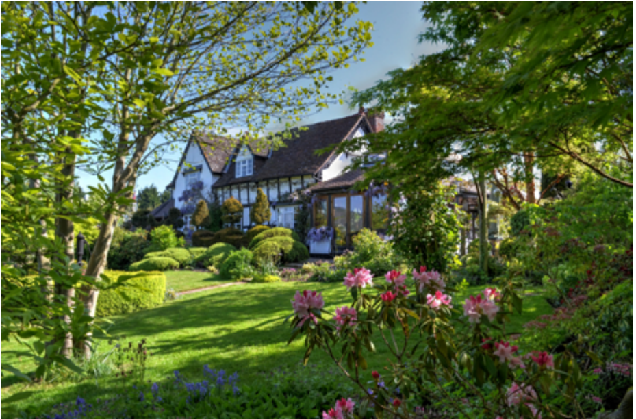
GARDENS OF WICHENFORD: Open as part of the Gardens of Wichenford open weekend on 8-9 June (see full report on page 13) is Pear Tree Cottage in Witton Hill. Pictured top: The Grade II listed black-and-white cottage (not open) viewed from the woodland border. Bottom: The garden's picturesque pond.