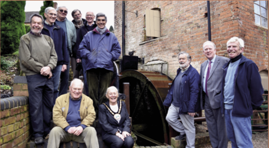
The Shelsley Walsh Water Mill Dibnah's

Clifton upon Teme • The Shelsleys • Lower Sapey