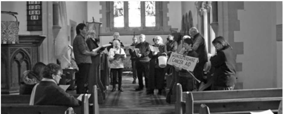
The choir and local parishioners pictured in St Bartholomew's church, Harpley.