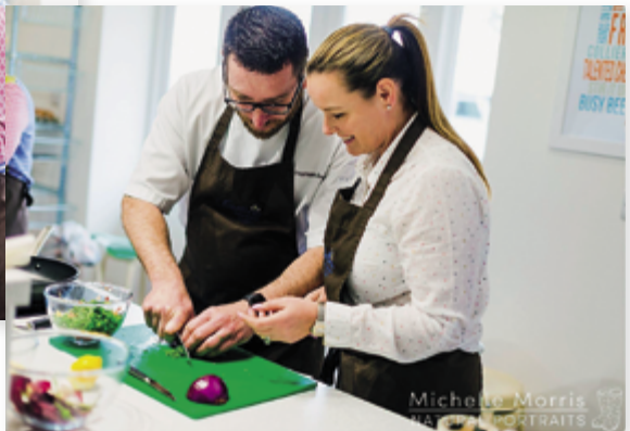
The new 'Colliers Cookery School' in action.