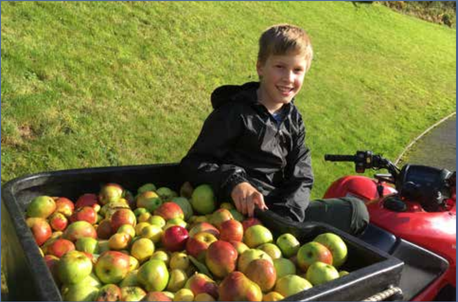
Apple picking time in the Shelsleys

Clifton upon Teme • The Shelsleys • Lower Sapey