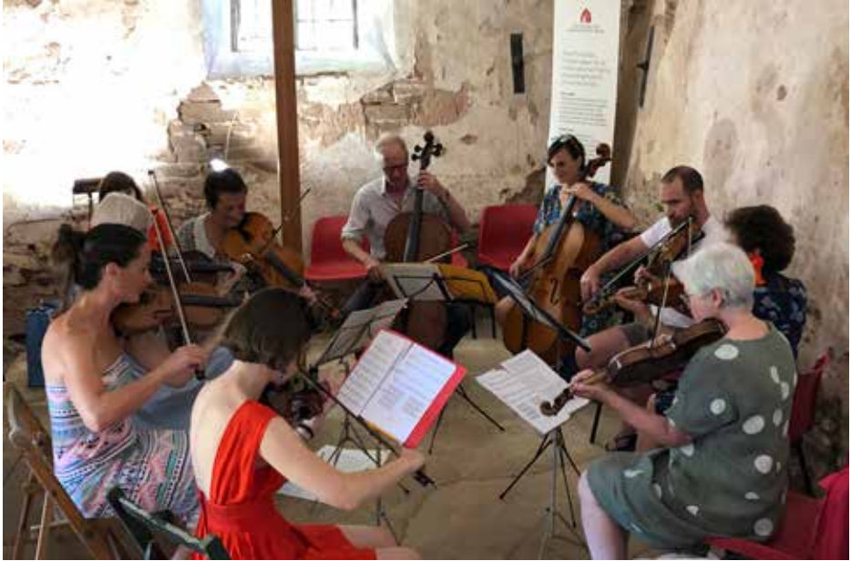
Musicians performing at the Annual Service of Celebration and Thanksgiving for the Life of Old St. Bartholomew's Church at Lower Sapey