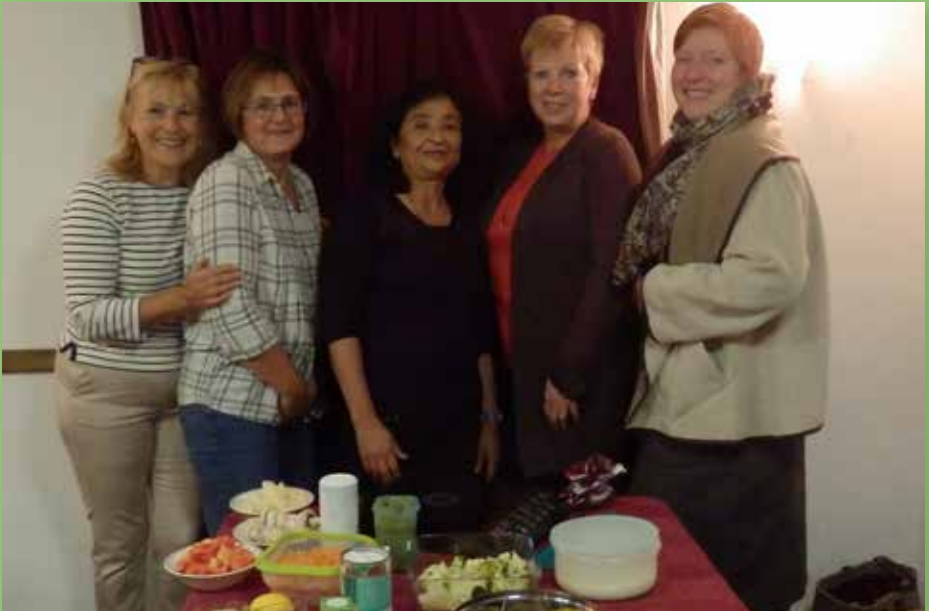
Clifton WI members Asian cookery evening

Clifton upon Teme • The Shelsleys • Lower Sapey