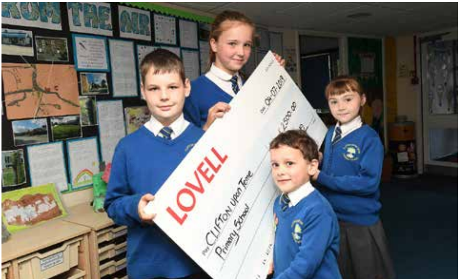
Clifton Primary School has received a donation of £2,500 towards improving the school's facilities from Lovell Homes, the developer of the Meadows housing estate in Pound Lane.