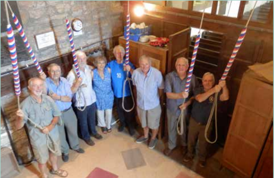
St Kenelm's Bells 350th Anniversary

Clifton upon Teme • The Shelsleys • Lower Sapey