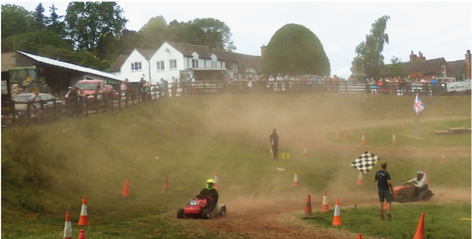
Lion mower racing at the New Inn in Clifton, attracted a large crowd as local competitors battled it out in a series of races