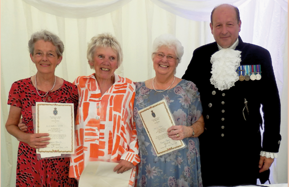
High Sheriff's Awards for Service to the Community

Clifton upon Teme • The Shelsleys • Lower Sapey