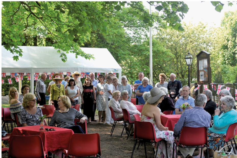
Harpley residents celebrate the Royal Wedding