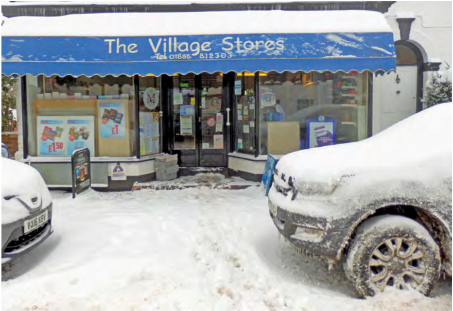
Clifton Village Stores open for business in all weather. Local farmers worked round the clock to keep the lanes open (below)