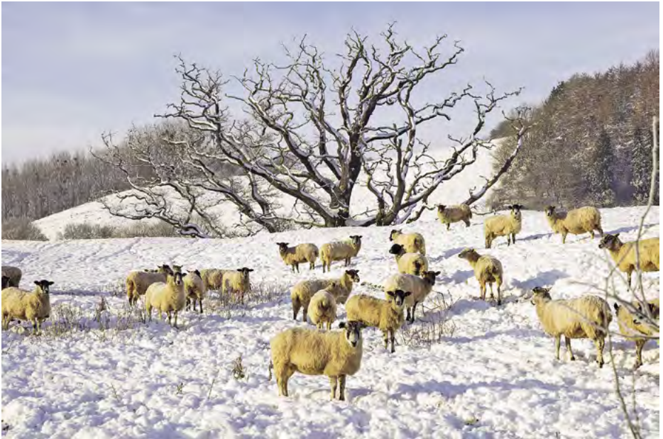
Sheep near Homme Castle Farm, Shelsley Beauchamp