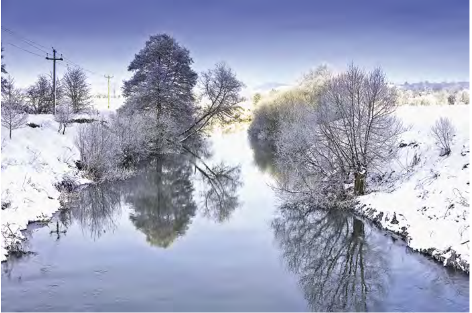
View from New Mill Bridge, Shelsley Beauchamp