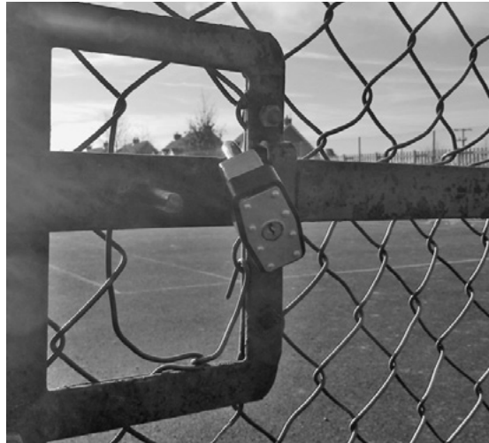
The padlocked entrance to the tennis courts.

In a letter to the Tennis Club, the Parish Council said it would 'assume responsibility for the tennis courts and close them to all users until further notice'. In addition, the club's 'user/hire rights' have been revoked and the Parish Council expressed 'disappointment about the lack of maintenance which had resulted in the deterioration of a community asset under the Tennis Club's stewardship'.