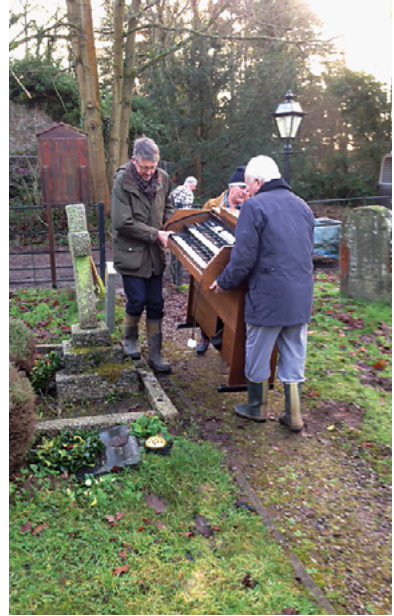
The new organ being carried into St Bartholomew's church in Harpley