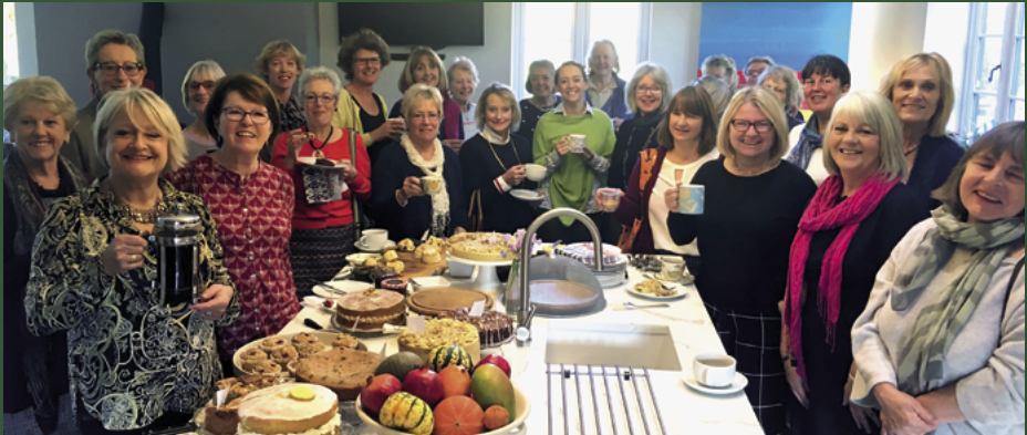
Shelsleys' Ladies Cakes Fundraiser

Clifton upon Teme • The Shelsleys • Lower Sapey