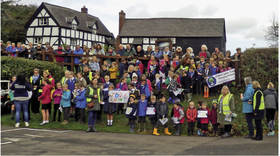
Local residents and pupils from Clifton Primary School at the Shelsley Walsh Hill Climb for the BBC One Show's Rickshaw Challenge for Children in Need.