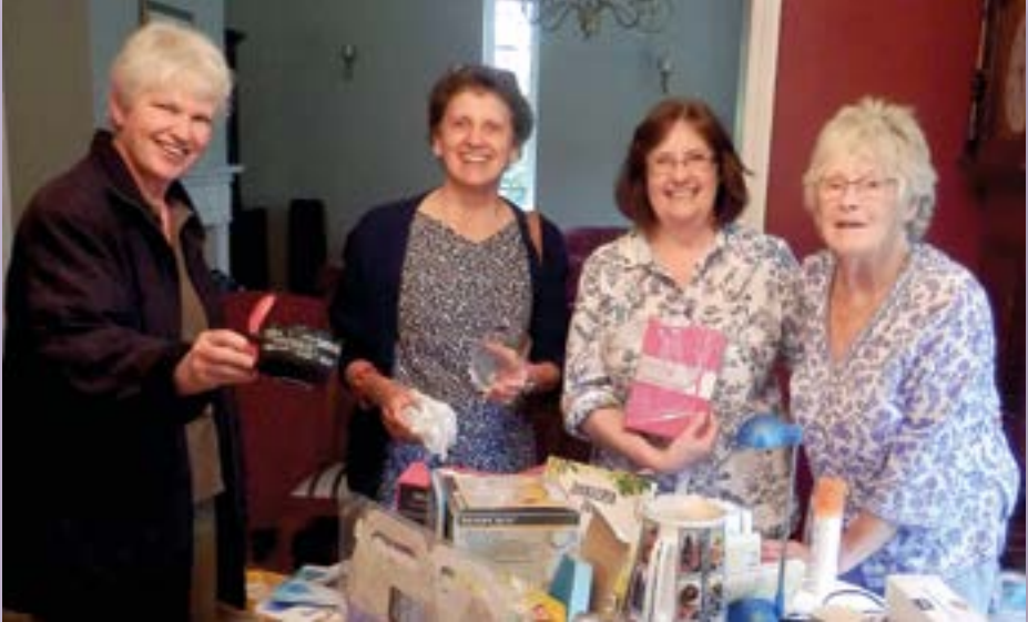
Clifton folk supporting Christian Aid

Clifton upon Teme • The Shelsleys • Lower Sapey