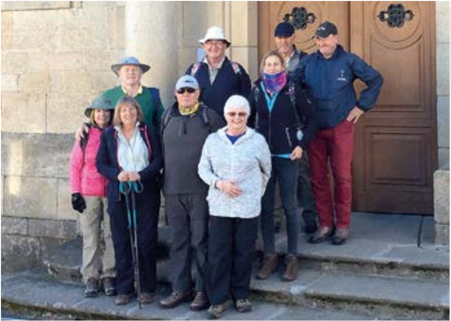
Local walkers on their pilgrimage in Spain