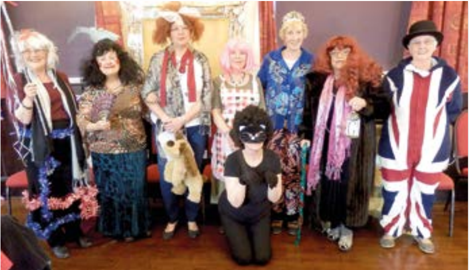
Clifton's Friendship Club in Cinderella