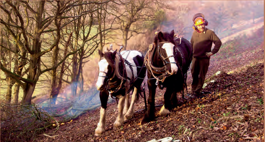
Pony Power in the Shelsleys

Clifton upon Teme • The Shelsleys • Lower Sapey