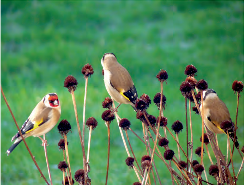
Garden songsters, our goldfinches. Read more on page 26.