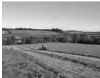
Rural, farms & estates