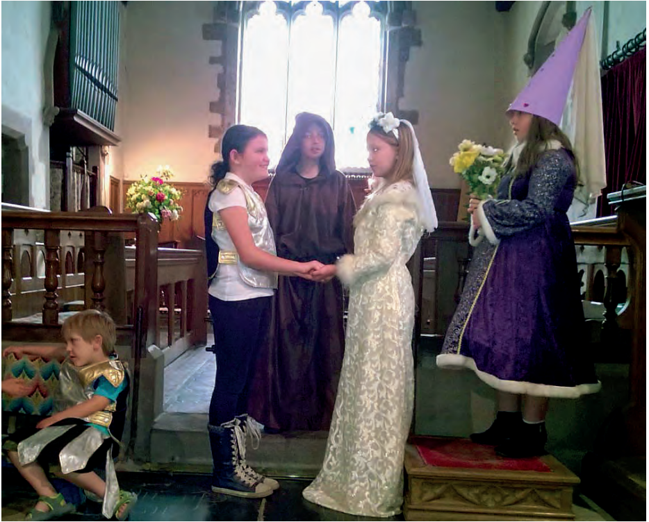
Local children taking part in a performance of St. George and the Dragon at St. Kenelm's church, Clifton.