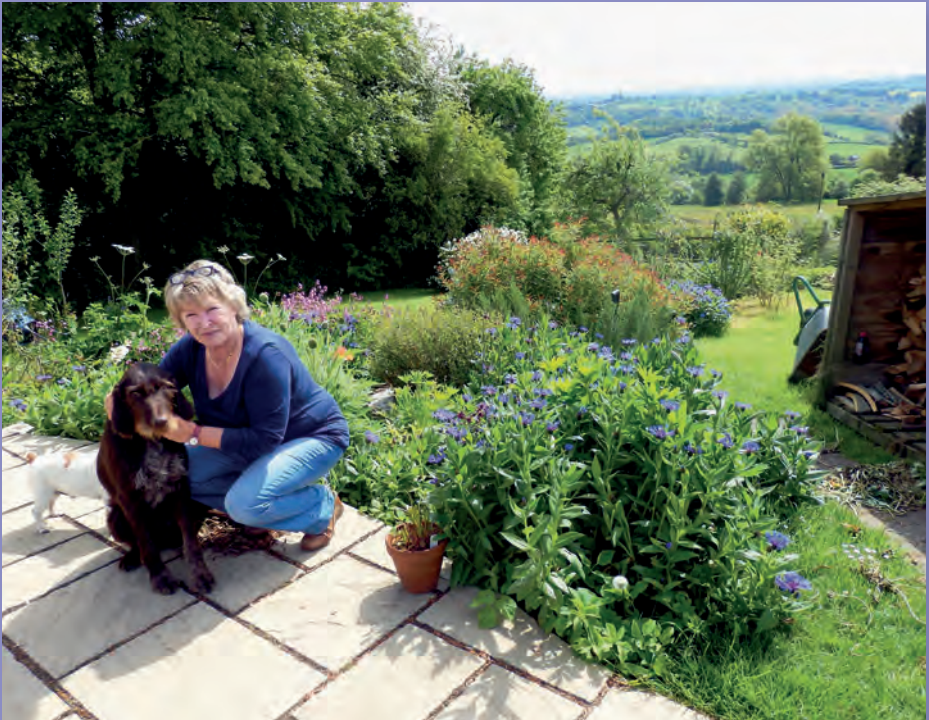
Clifton Open Gardens Weekend