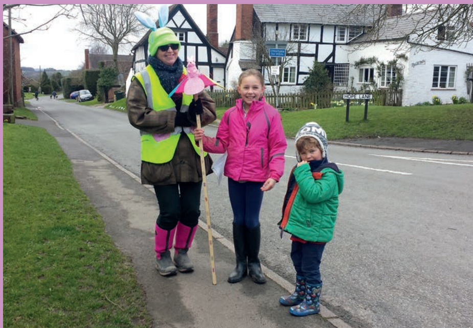
Clifton Easter Egg Trail