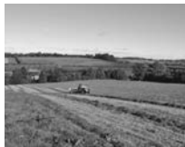
Rural, farms & estates