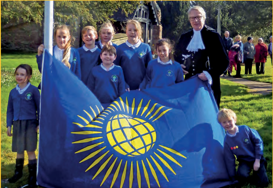
Flying the flag