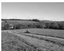
Rural, farms & estates