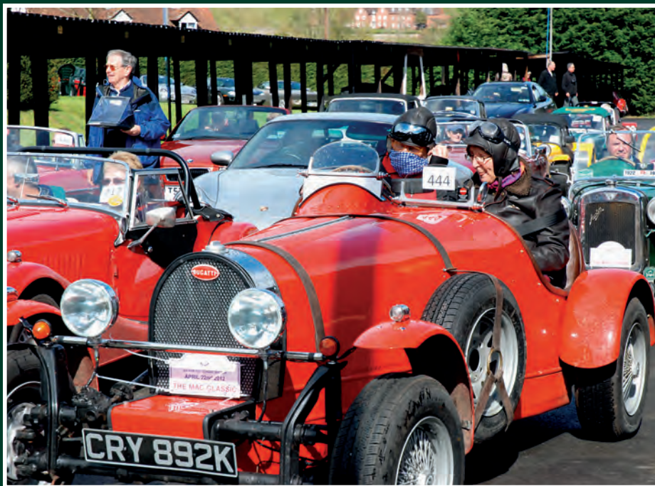
Shelsley Walsh season revs up