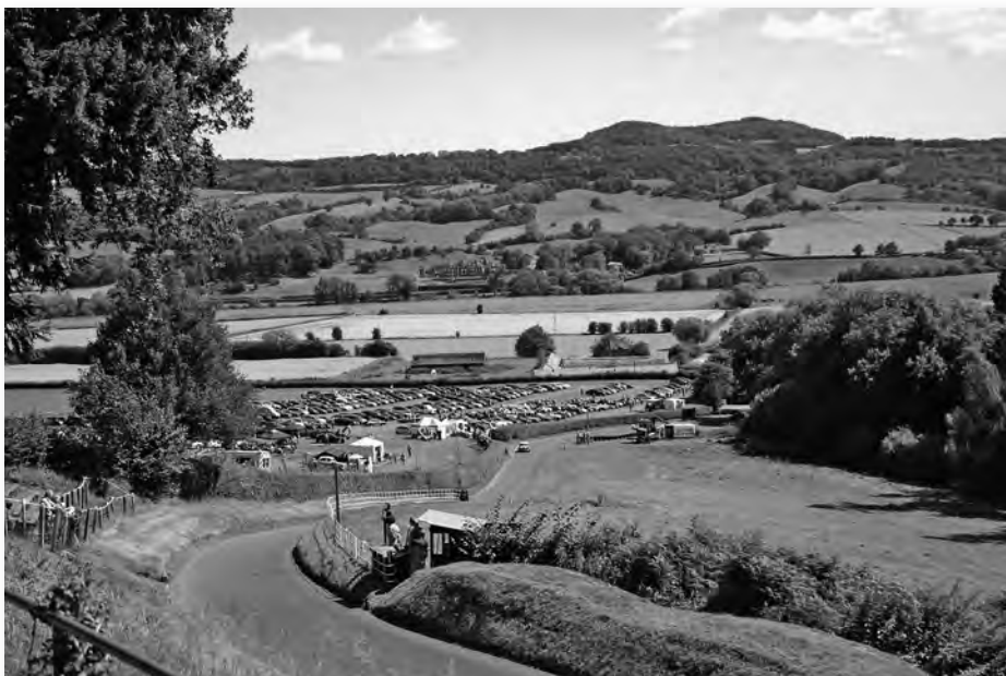
The world famous Shelsley Walsh layout

More information about the Red Marley Motorcycle weekend on http://www.redmarleyhillclimb.com