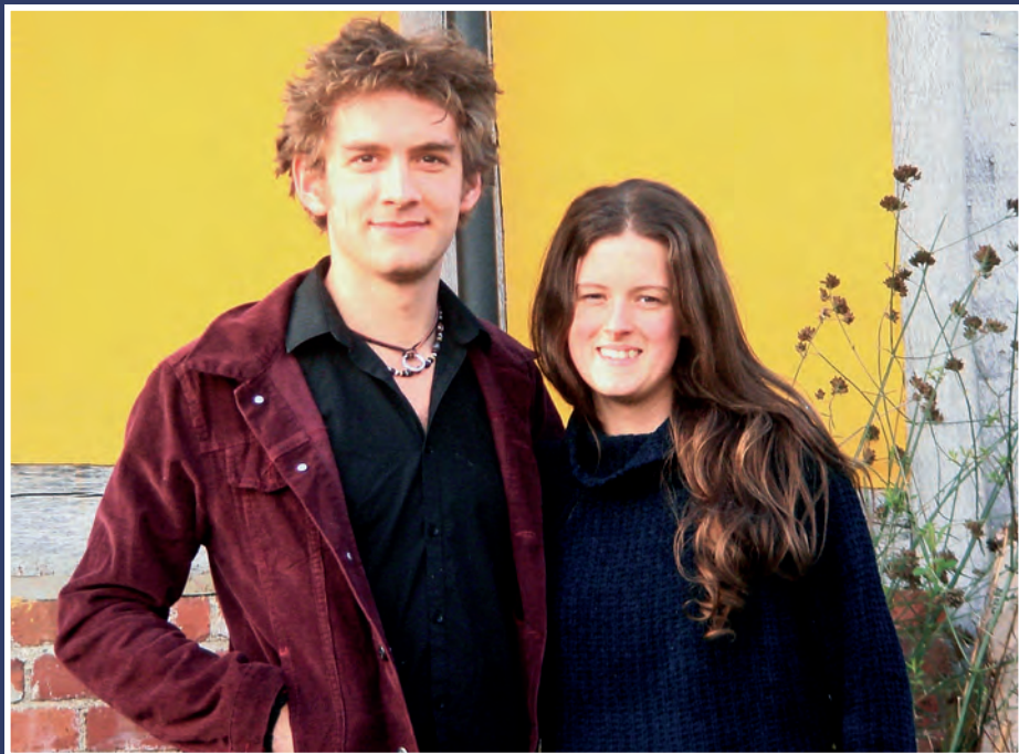
Foot tapping in the Teme Valley