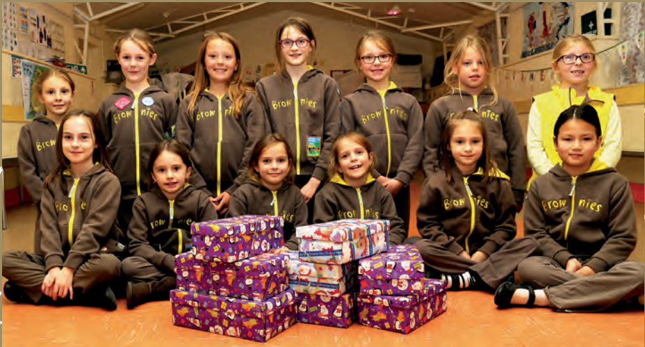
Happy Christmas from Clifton upon Teme Brownies

Clifton upon Teme • The Shelsleys • Lower Sapey