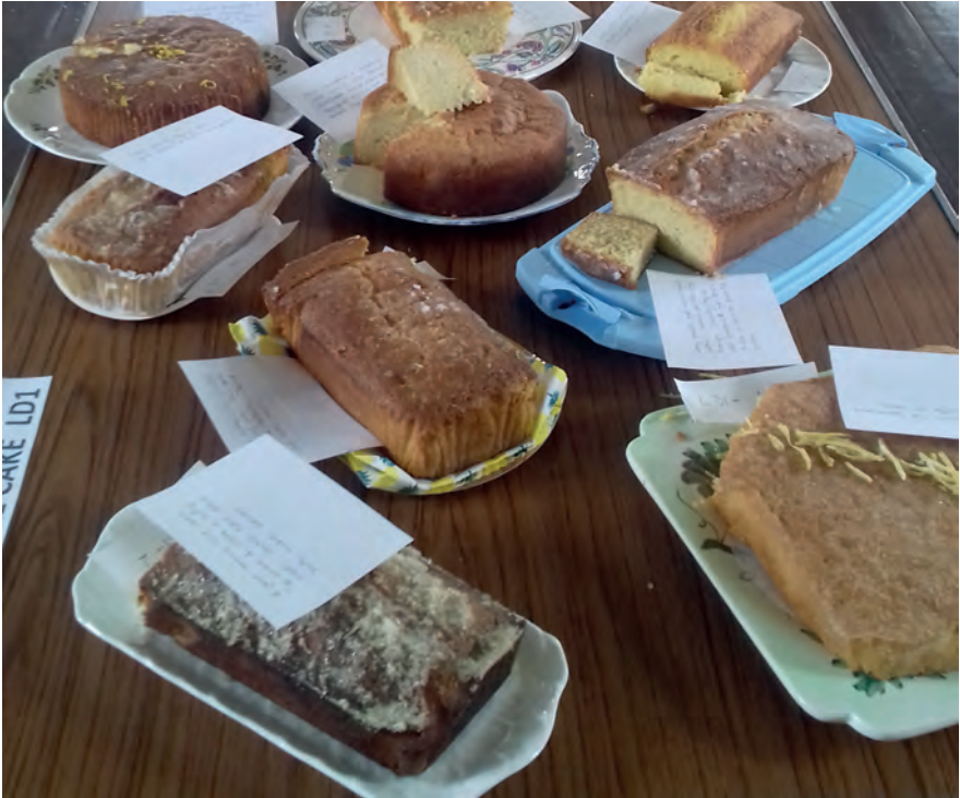
Just a few of the scrumptious cakes on display at the Great Clifton Bake Off organised by the Clifton WI.