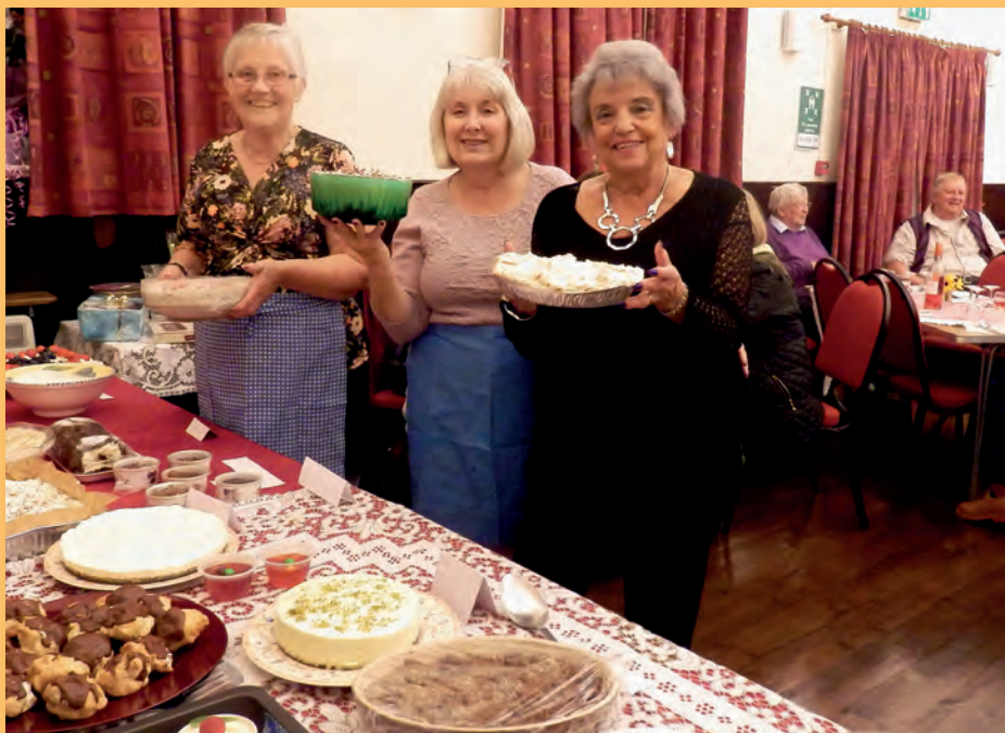
Clifton Friendship Club's Pudding Extravaganza