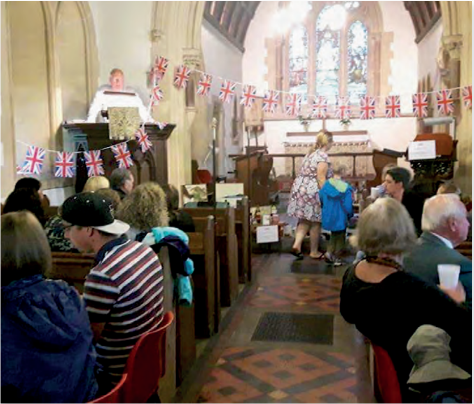
Ever versatile Harpley - serves breakfast in church!

EDITOR: Judie Welsh: editortemetriangle@gmail.com