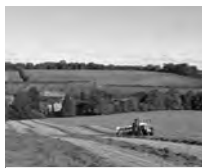
rural, farms & estates

E: george.pickard@hallsworcester.com M: 07817 254 372 D: 01905 728 436