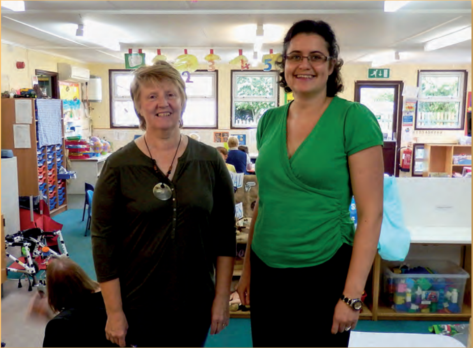
Clifton Nursery New Team