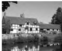
country & village sales