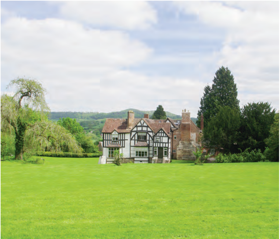
The Court House revealed