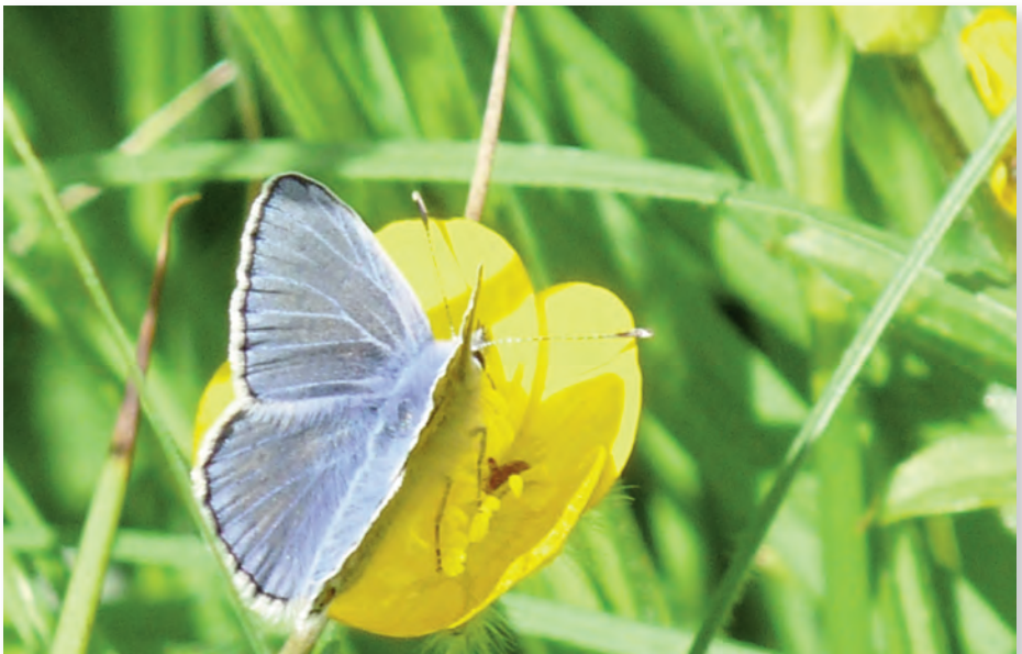
Look out for the Common Blue in June.