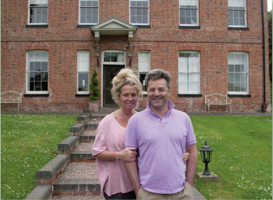
Welcome to the Court House