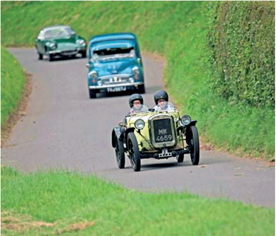
Shelsley Walsh Hill Climb hosts many events this summer