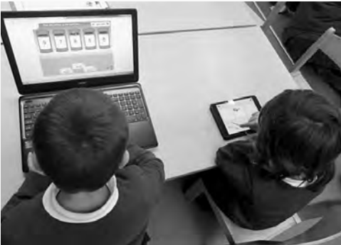
Pupils using some of the new IT equipment.