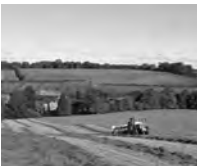
rural, farms & estates

E: george.pickard@hallsworcester.com M: 07817 254 372 D: 01905 728 436