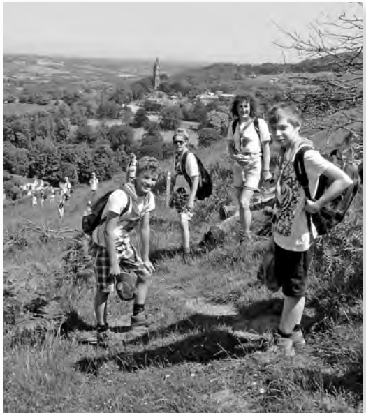
Clifton Scouts on the Worcester Way