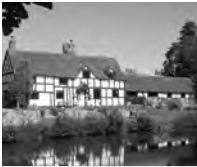
country & village sales