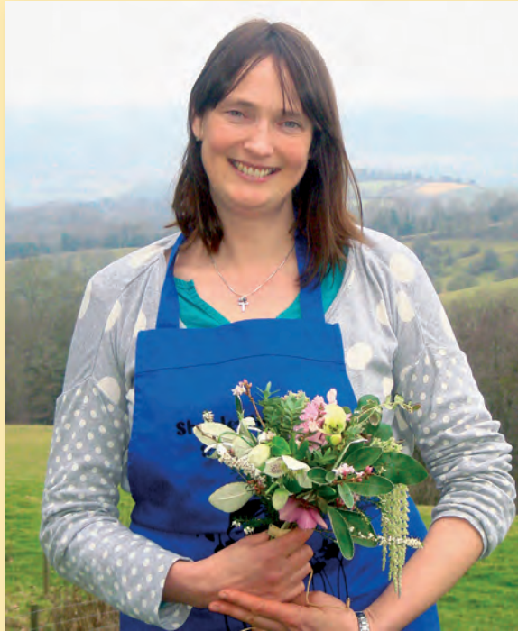
Blooming marvellous new enterprise