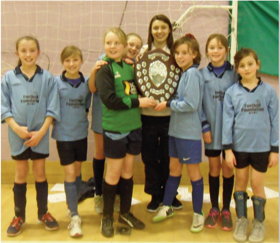
Clifton's winning girls' Five-a-side football team