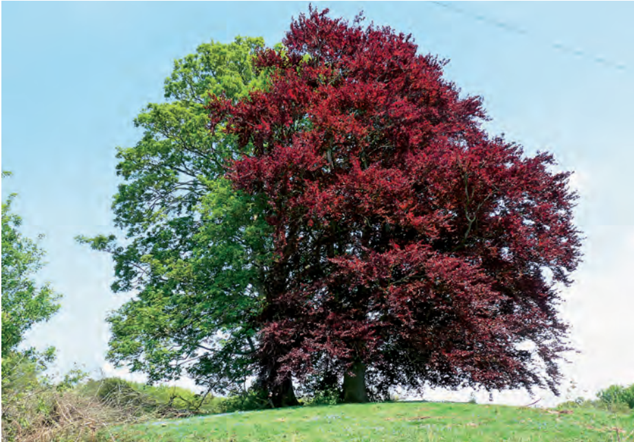
Ancient trees in the Teme Valley