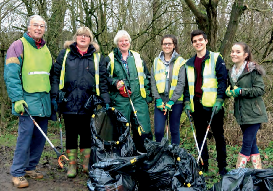
Clifton and Harpley's litter team