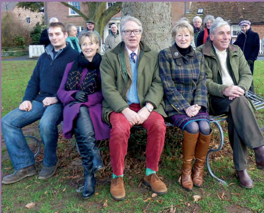
New Clifton Tree Seat Marks WI 50th