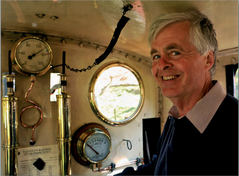
Pioneers steaming ahead