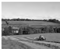
rural, farms & estates

E: george.pickard@hallsworcester.com M: 07817 254 372 D: 01905 728 436