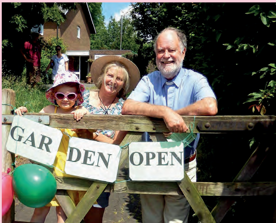
Clifton Open Gardens Weekend