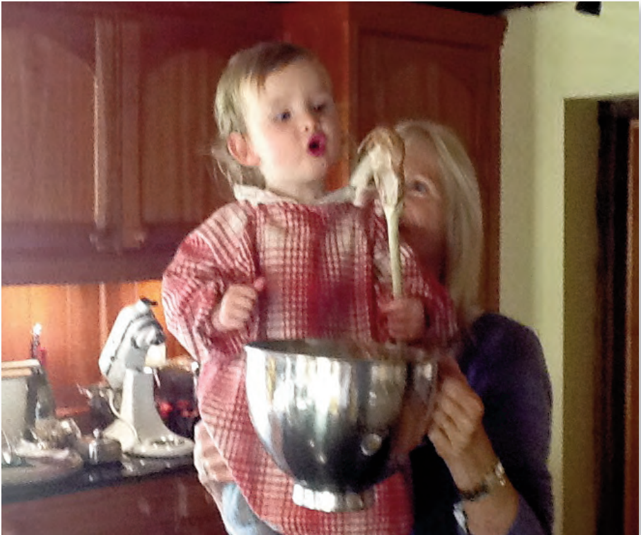
ooh figgy pudding