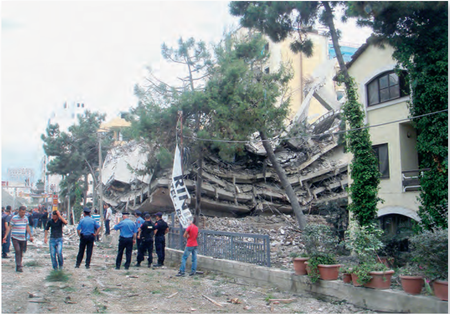
The Albanian response to unlawful development