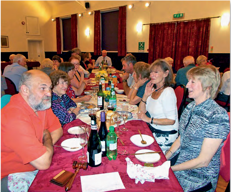
Clifton W.I. Celebrate 50 years with a party in the Village Hall